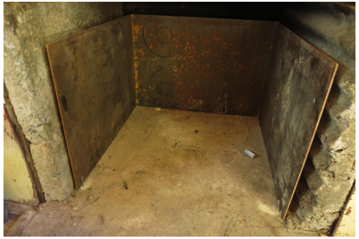
A steel insert was also placed in the fireplace to protect the crumbling concrete form further decay. A cap was made for the chimney top and a flashing installed to catch leaves between the roof and chimney.

The chimney was extended to above the ridgeline and a vent was placed in the floor to ensure the fire would draw correctly.