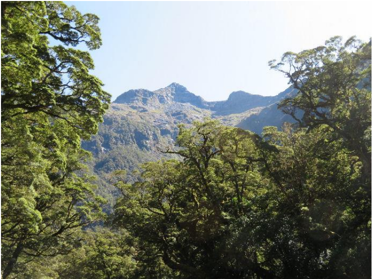
Mount Troup and the track end on the Lyvia River.