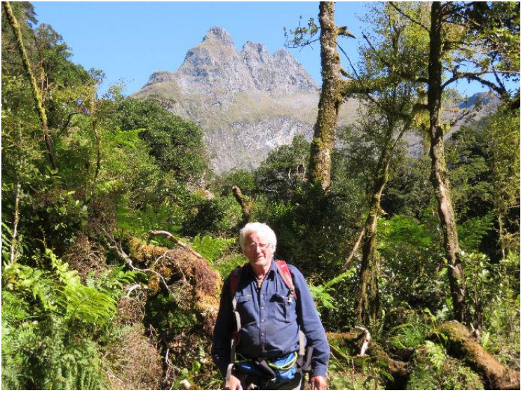
The Three Black Giants.